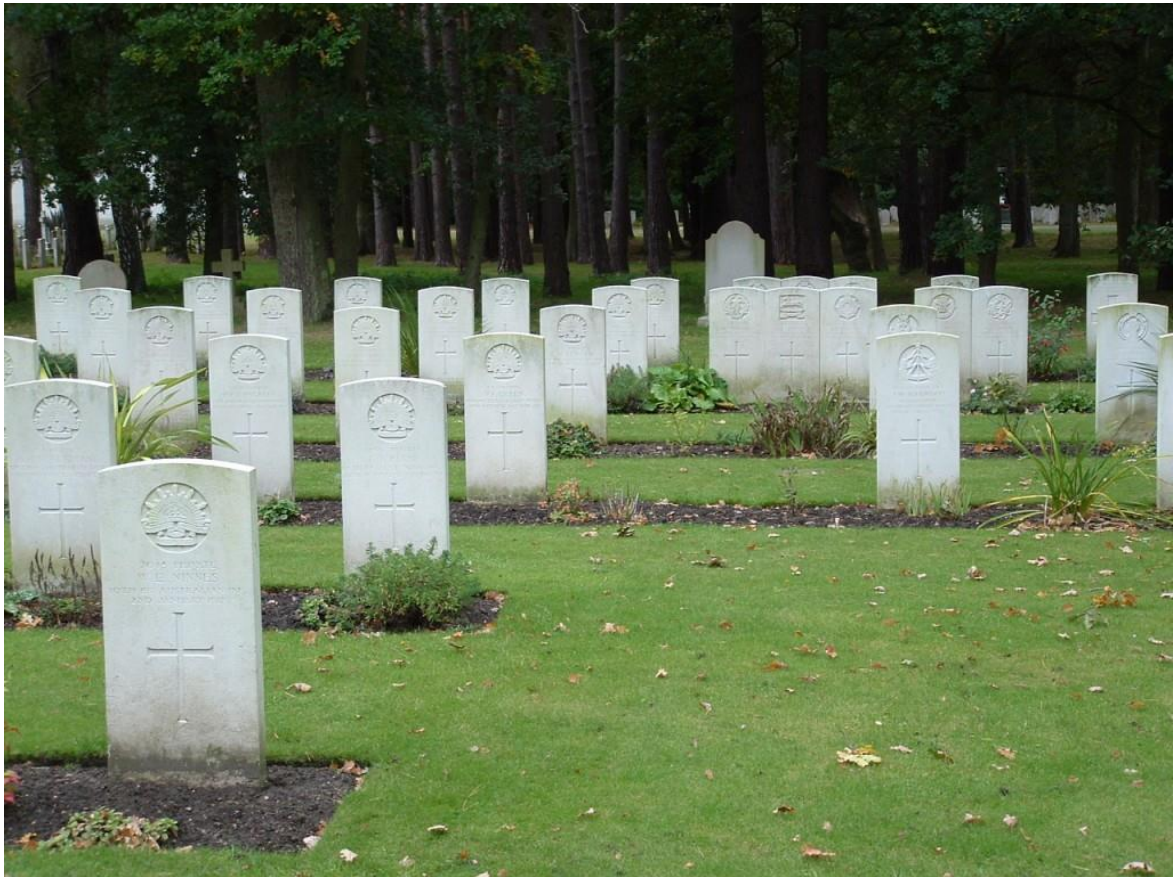
Australian Graves in Brookwood Military Cemetery