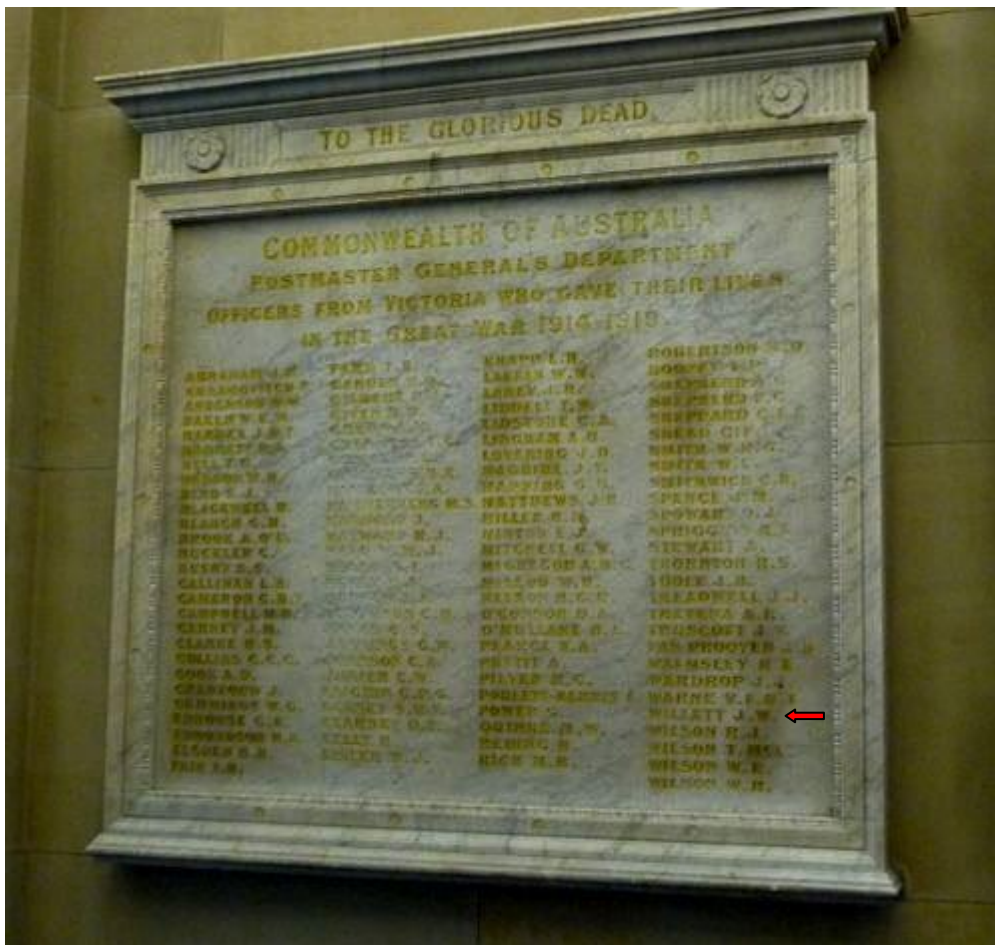
Postmaster General's Department Honour Roll, Melbourne