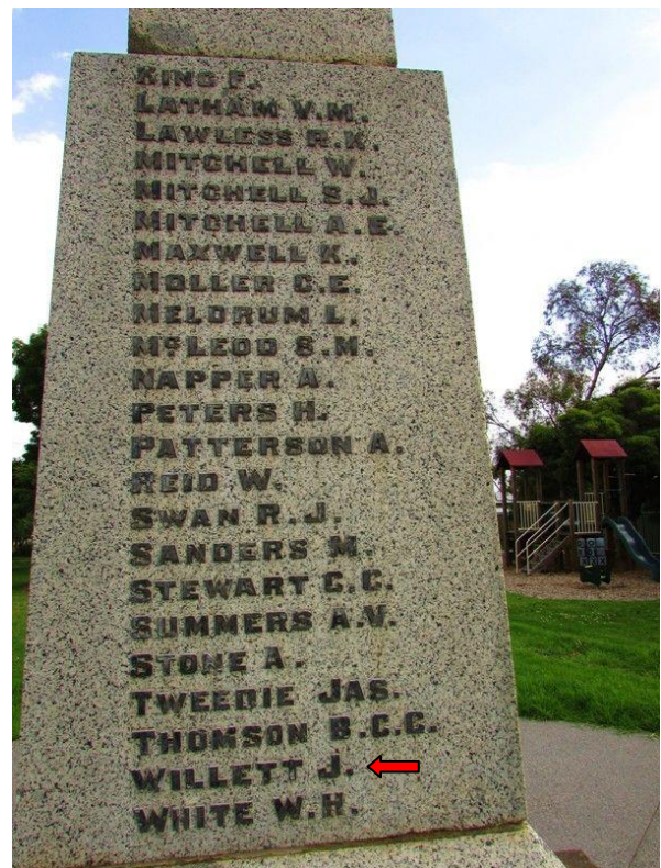
Stratford War Memorial